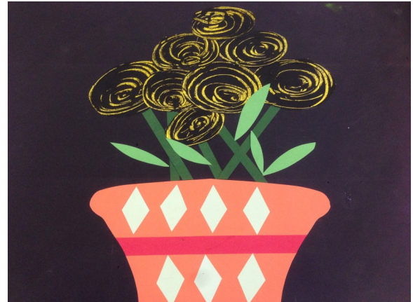
Chase, Angelina, Rhys and Kye holding some of their amazing art. The roses were created by 'twirling' a pop stick on wet paint.

The Year Four class have spent the last two Art classes painting, collaging and assembling floral displays to put around the classroom. Students painted their flowers and used collage paper to arrange them in decorated pots.