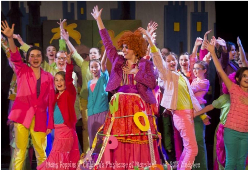
Mary Poppins idea: